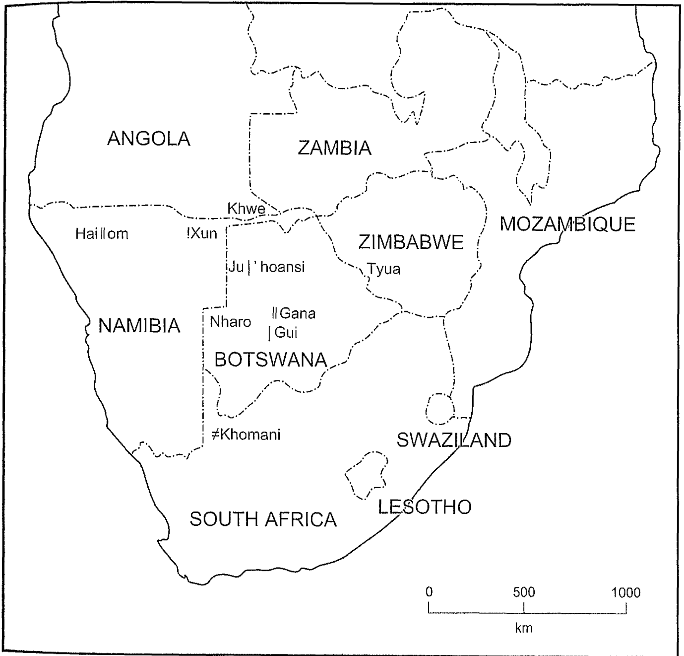
The San groups in the study areas in this volume