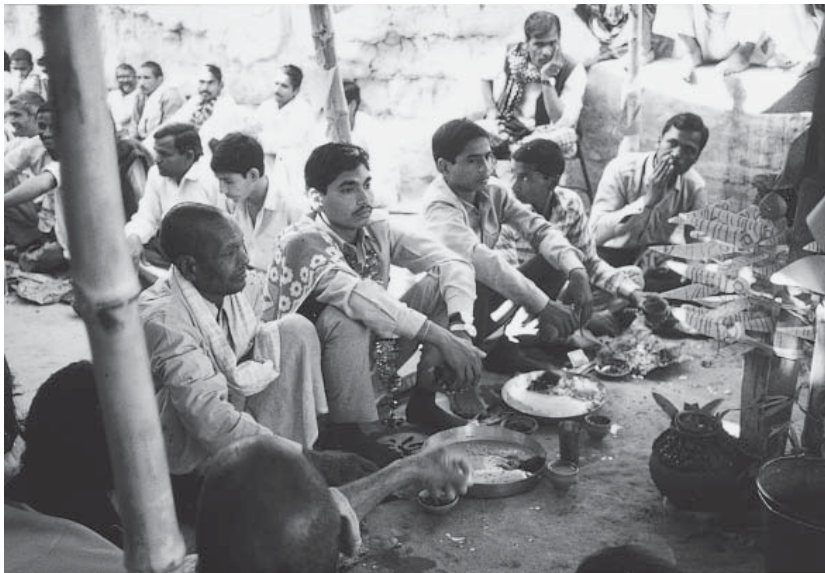
Plate 4 The khiṛī khānā (when the groom is given dish of khiṛī , women of bride's side sing abuse songs to the groom)

What is the meaning of singing these abuse songs to the bridegroom and his relatives in the presence of many villagers and the bride's relatives? According to Doranne Jacobson,