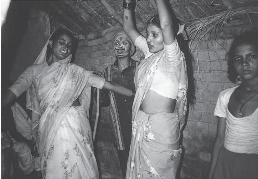
Plate 5 The naktoriya (a village woman wear men's clothes and dances with another woman)

Here, chinaro has a double meaning in Hindi. The surface meaning is 'a lazy woman' whereas the second meaning is 'a prostitute'. We should note that gālī and erotic dances are performed just before and just after the rituals for actually becoming husband and wife. During the six days before the byāh rituals, no abuse songs and erotic dances are performed. Specifically, erotic dances takes place after byāh rituals such as sindūr dān as well as before and after other important rituals that complete the marriage ceremony. After the marriage ceremony, people consider childbirth to be the next step. In the last part of the naktoriya ritual, women sing sohar songs. Sohar songs are generally sung when a boy is born. For these reasons, we can think of performances of abuse songs and erotic dances as imitations of sexual intercourse.