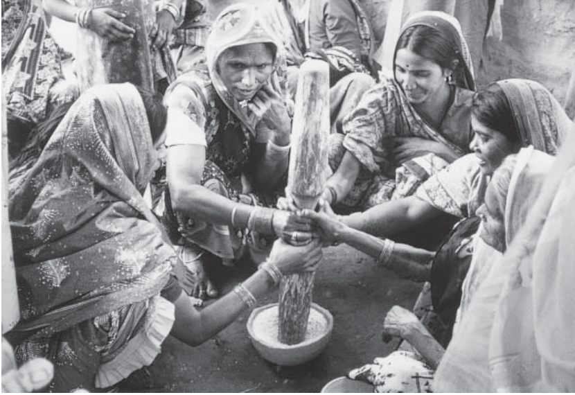
Plate 2 The kūṇā (five married women pounding rice of pestle, who prepare meals for ancestors)