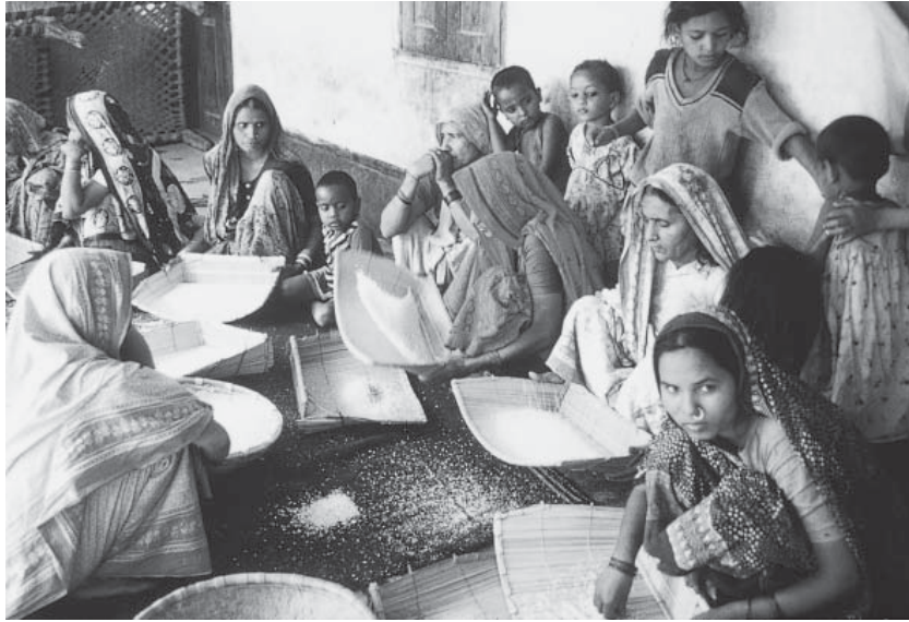
Plate 1 The urd cāval chānnā (female relatives and neighbours sift urd beans and rice by winnowing baskets with singing songs)

On the fourth day, women perform a rite called urd kā dhoīyā dhonā . They wash and peel black urd beans, and make cakes by kneading these with white urd as they sing. These rituals symbolize warding off evil spirits for a successful marriage. During the marriage ceremony, the bride and a bridegroom are believed to be susceptible to evil spirits that can easily take possession of them because they are so charming at this point in their lives.