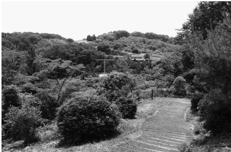
Photo 3 Since it commands a nice view, this temple also serves as a good place for walks

statue. These people are included in the total number of visitors reported each year.