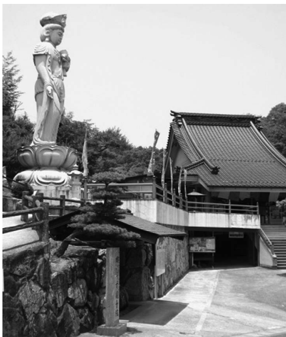
Photo 1 “Bride Free” Temple in Okayama Prefecture

ism, and therefore it can be said that Hinoshiriyama Kannon Temple or Bride Free Temple is being restructured under “the Tourist Gaze” (Urry 1990).