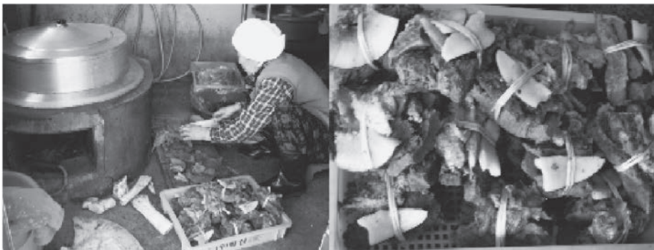
Photo 2 Whale meat retail wholesaler and whale meat (Photo by Sun-ae Ii, 2013)

KY and her family eat Risso's dolphins ( Grampus griseus ), but they do not eat other dolphins, considering them smelly and greasy. Striped dolphins ( Stenella coeruleoalba ) were once available when the cold wind blew, and their skin is thick and delicious, but they have not been seen since 1986. The value of each product of the minke whale, from high to low, is this: raw meat, intestines, blood, obegi , and une . The price of raw meat retails for around US$33/kg. In Jangsaengpo, obegi is still an important dish for big events like funerals and weddings.