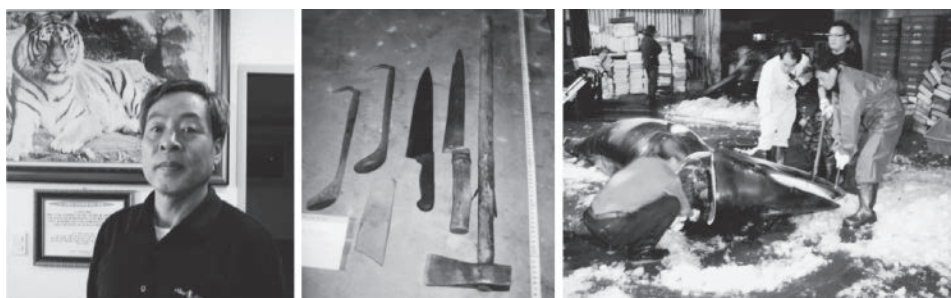
Photo 3 A whale dismantler, his dismantling tools, and a minke whale he dismantled (Photo by Sun-ae Ii, September, 2008, in Pohang)

JU thinks that dismantling whales is his lifetime job. He is regarded as having mastered a special skill and is a symbol of human victory to the local media, but he has been called a barbarian for killing whales by anti-whaling groups and the center media. JU thinks that, in accordance with Western-centered thoughts and standards, the Korean government and anti-whaling groups now think of whales as special animals and ignore whale experts who preserve and use whales as maritime resources.